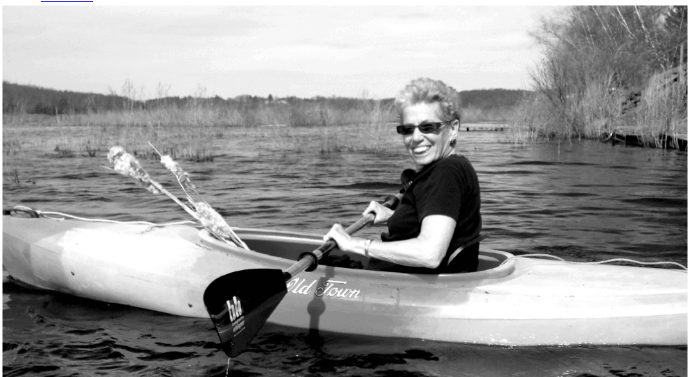
All Inspirational Stories